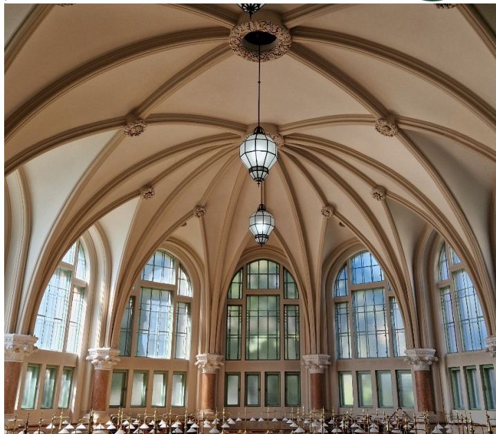
Library of the Budapest University of Technology and Economics